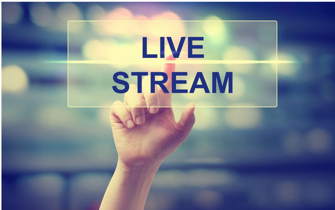
Figure 1: Live Stream Photograph (Zanger 2016)

Have you ever thought your crisis communication tactics might be outdated and ineffective? Does your crisis communication plan account for the latest technological advancements and the change in your stakeholders' news consumption habits? This article introduces you to the idea of having your next crisis statement live-streamed in order to increase not only your transparency, but also your chances to be in control of the narrative throughout the entire crisis communication process.